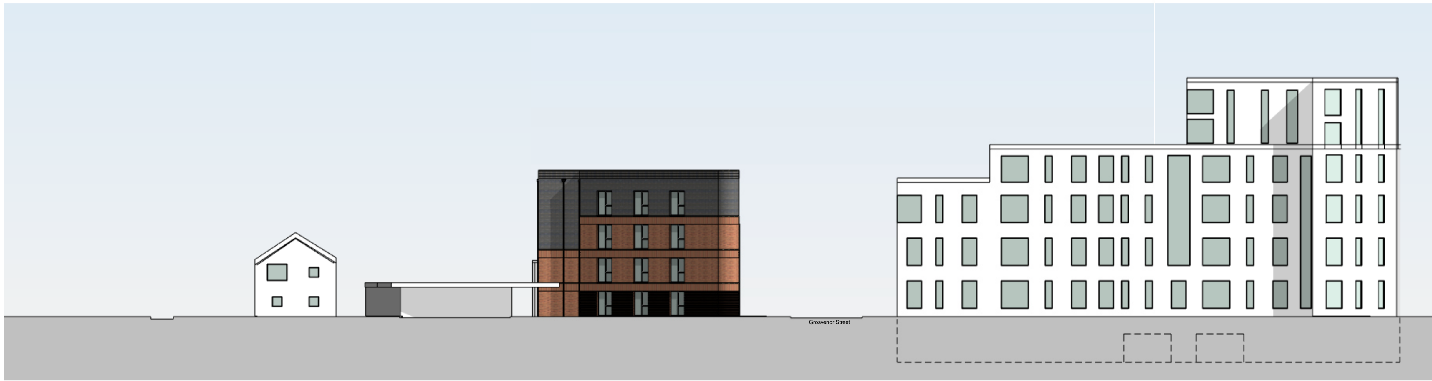
Street Scene E Scale @ 1 : 200