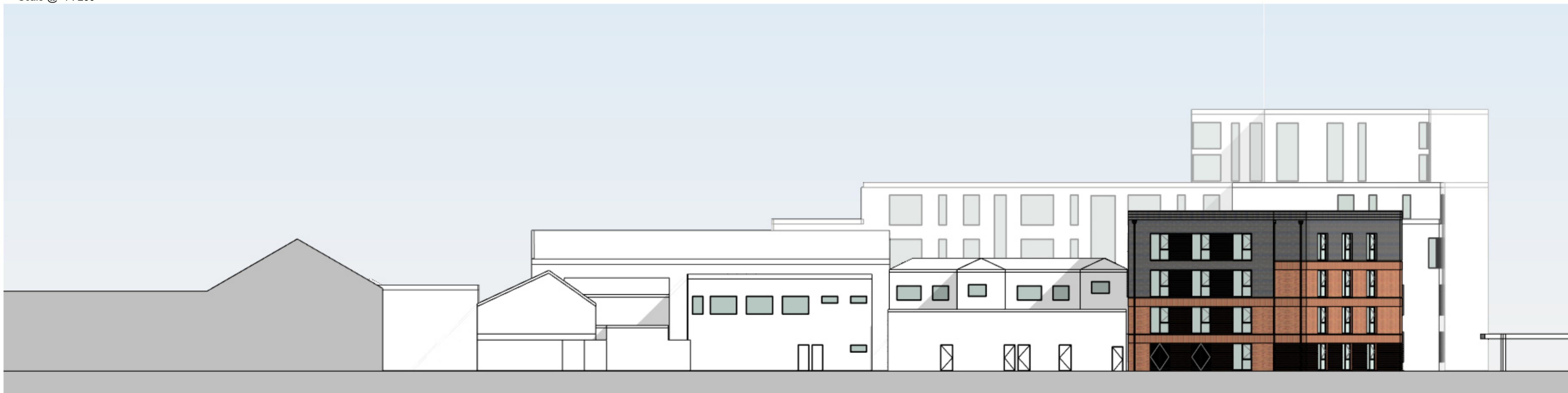
Street Scene S Scale @ 1 : 200