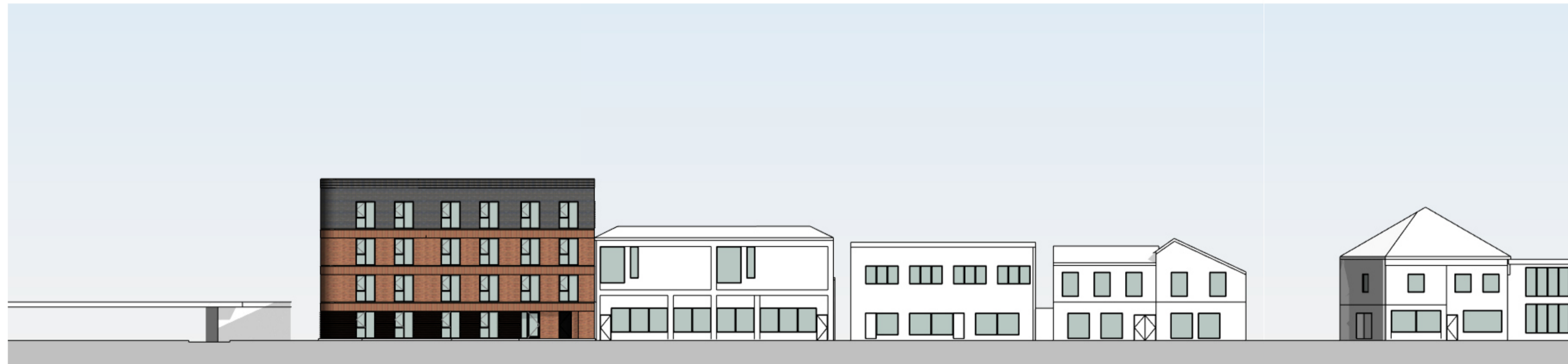
Street Scene N Scale @ 1 : 200